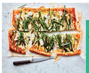
Dinner in French MY RECIPES BY WAY OF FRANCE Melissa Clark

Film isn't the only artistic game in this town. Sign up for a workshop at the Sundance Mountain Resort , and learn to throw a pot, bind a leather journal, or make a bracelet with semiprecious stones. Daily; from $95 , sundanceresort.com .